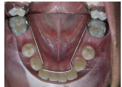
Lower Lingual Arch